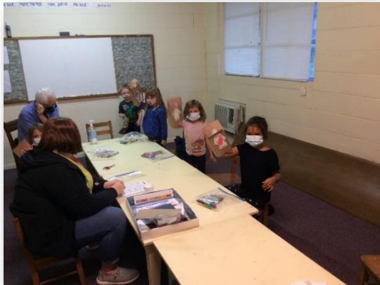
Remembering Jesus in the story of Mary anointing Jesus.

Wow!! What an awesome month March was at Kids' Klub. Kids' Klub celebrated Lent by learning about Jesus and Easter. We traveled closer to the Cross each week as we learned about Mary anointing Jesus, the Last Supper, prayer in the garden, Palm Sunday, and the Resurrection of Jesus. We send out a special thank you to those that have supported us with their prayers and donations. Thanks for helping to make Kids' Klub so special. If you are a kid between three years old and eighth grade come and see what blessings God is showing us in April. We will be continuing our journey as we learn about Jesus' love, play games, sing, and pray together. Supper will be served each week. We are looking forward to seeing you from 5:00 to 7:00 each Wednesday afternoon.