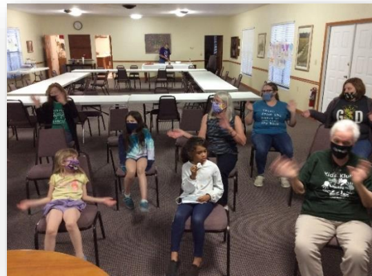
Praising God through song.