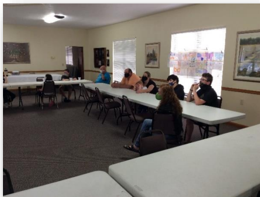
Remembering and learning the memory verse.