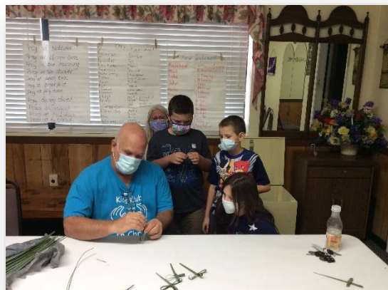
Making Palm Crosses for Palm Sunday.