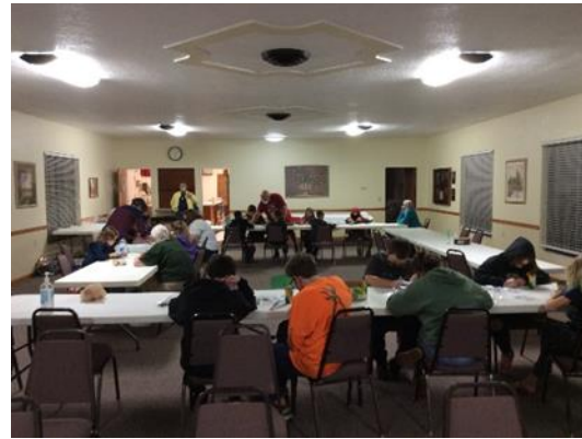
Working at three stations learning about the birth of John the Baptist