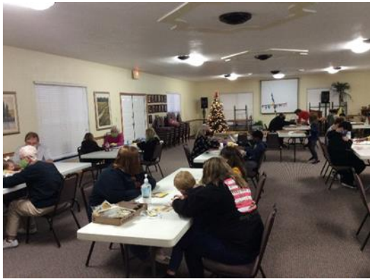
Preparing for Advent through the Advent Workshop